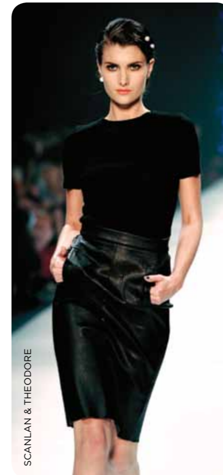
SCANLAN & THEODORE