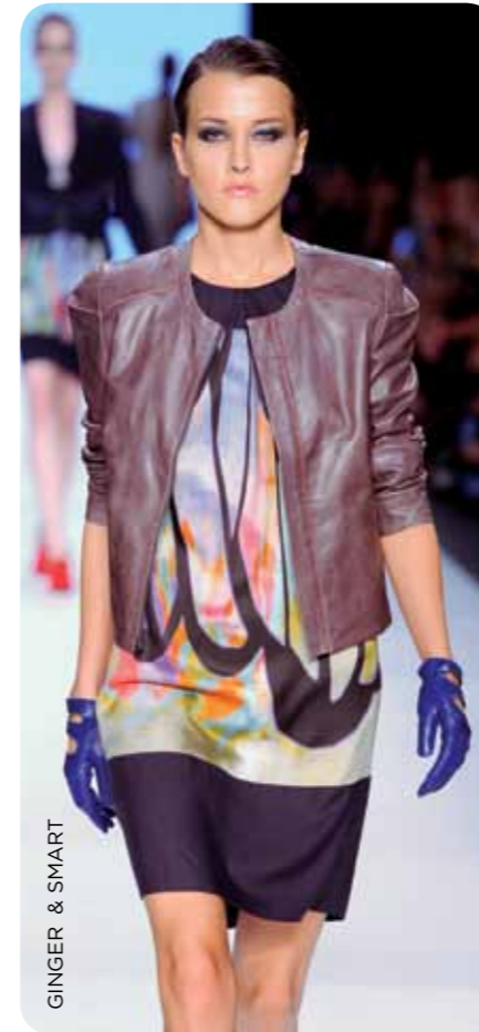
GINGER & SMART