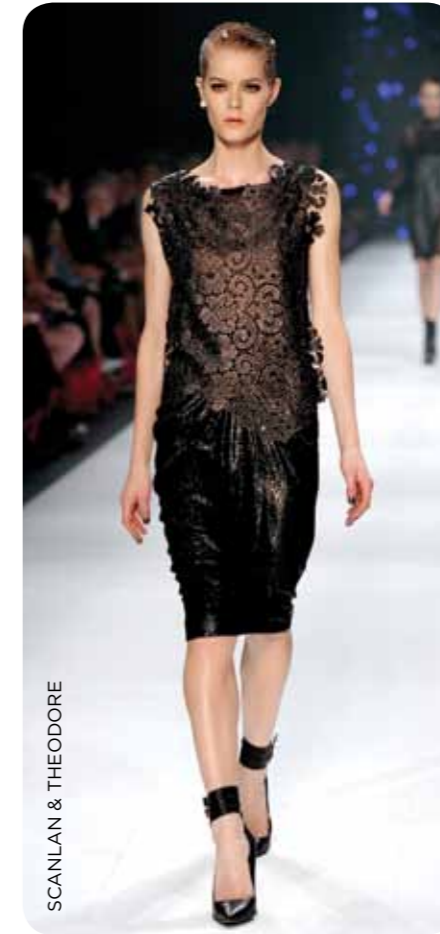
SCANLAN & THEODORE