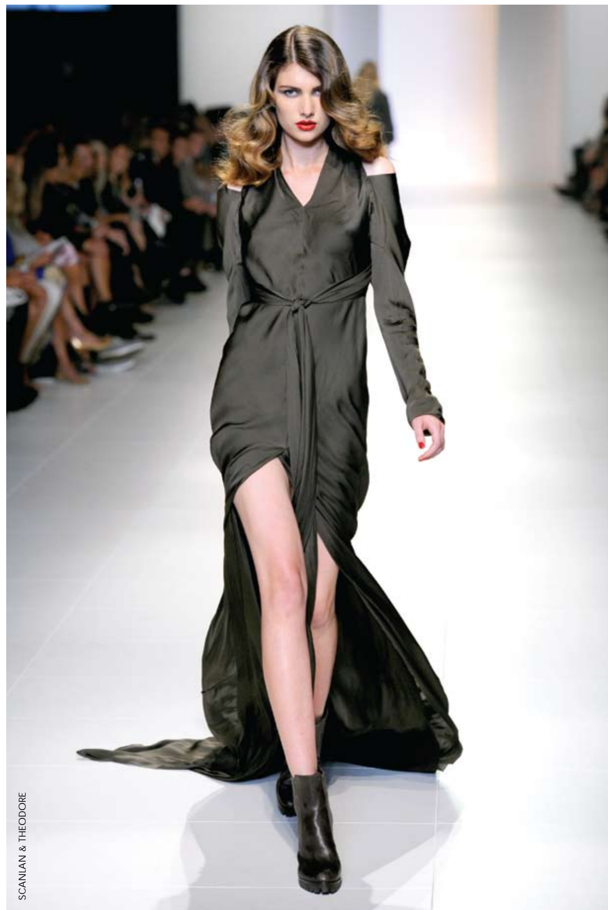
SCANIAN & THEODORE