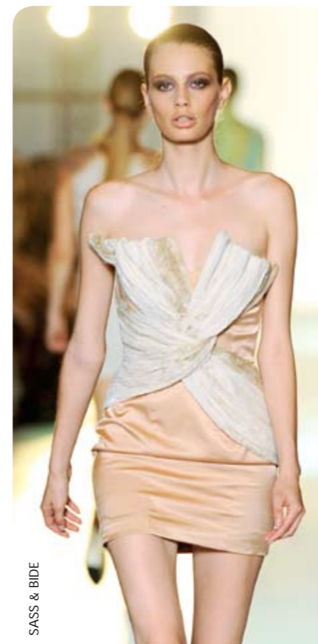
SASS & BIDE