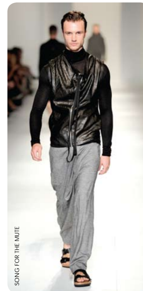
SONG FOR THE MUTE