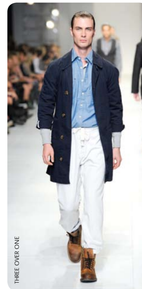
THREE OVER ONE