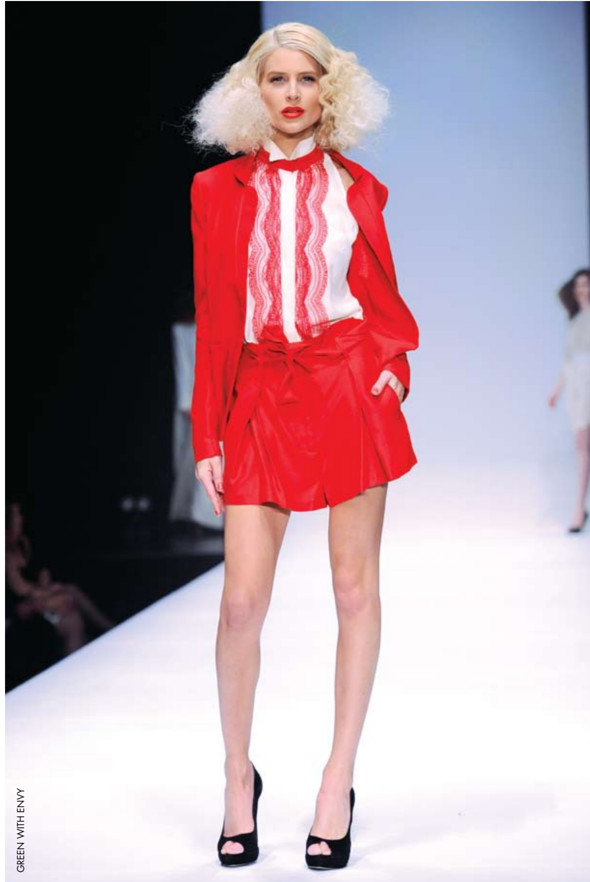
GREEN WITH ENVY